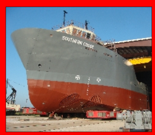
See more photos of this incredible move! Click Here!