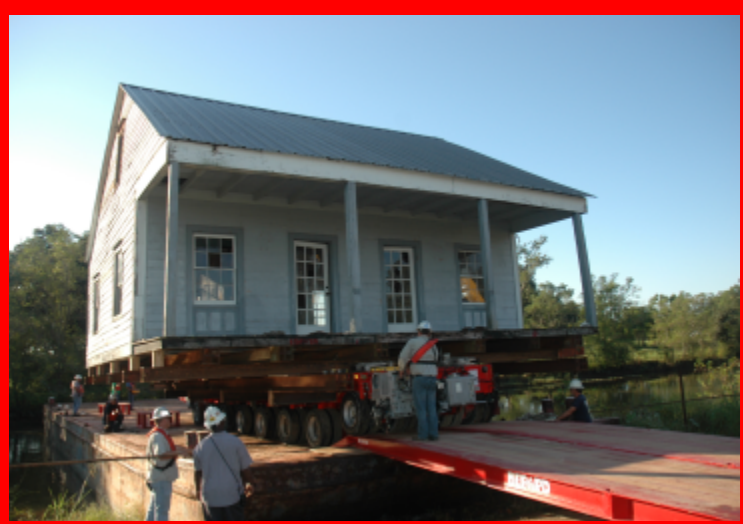
Loading onto the barge.