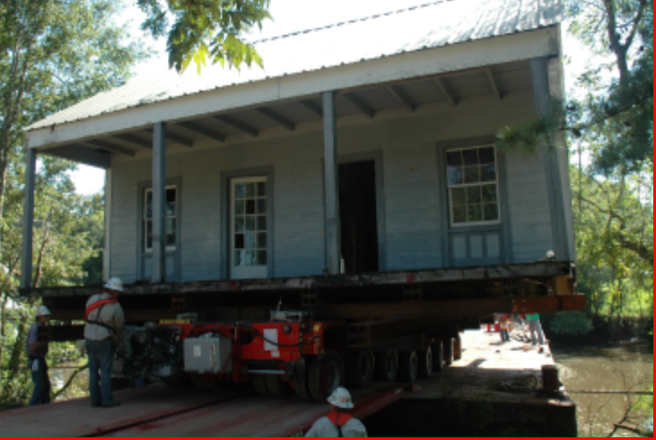
Rolling off at the new location.