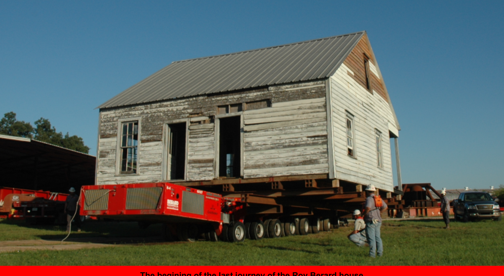
The begining of the last journey of the Roy Berard house.